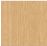
Tasmanian Oak TrueScale™ CF