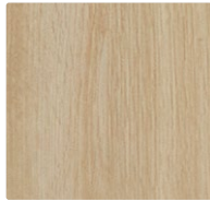
Calm Oak CF