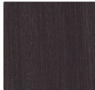
Blackened Legno CF B40 B60 VG100