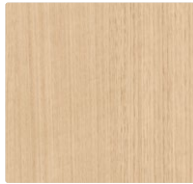
Victorian Ash TrueScale™ CF