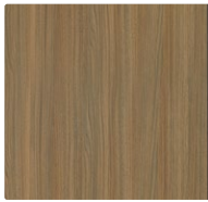
Classic Flat AbsoluteGrain®