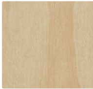
Raw Birchply CF B40 B60 VG100