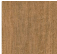
Spotted Gum TrueScale™ CF