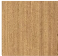
Sublime Teak CF B40 B60 VG100