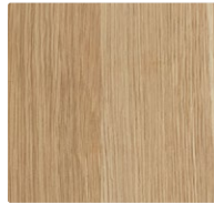
Classic Oak CF B40 B60 VG100